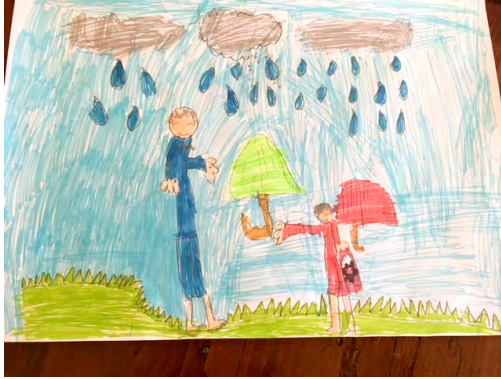
Seniors' mobility at a primary school in Rome