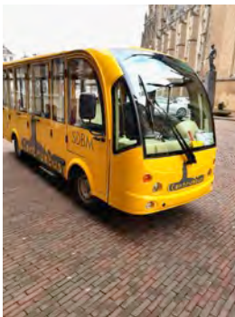
Electronic hop-on/ hop-off bus, Zutphen