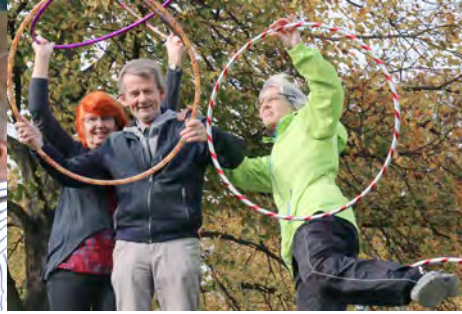
Photo Project 'Old age on the move', Hanau