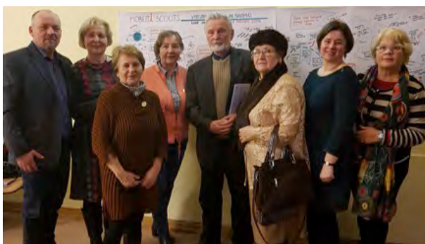
Round table for better public transport in Kaunas