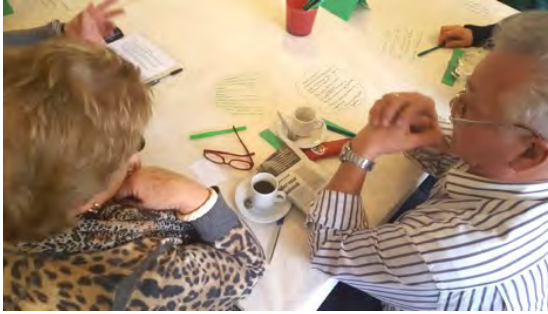
Small-scale public workshops in districts, Zutphen